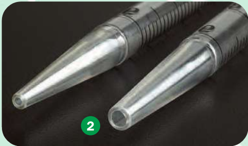
10mL Standard vs. 10mL Wide Tip Pipet

All serological pipets are manufactured to the ASTM Standard Specification for Serological Pipets E-934 1 Bi-directional (positive and negative) graduations are printed in bold easy-to-read black ink 2 10mL Wide Tip Serological Pipet for viscous solutions - Wide Tip opening is 4x larger than standard 10mL pipet 3 25 & 50mL pipets feature an anti-drip tip for accurate delivery 4 Premium material barrier plug 5 Color coded stripes and packaging enable quick volume identification 6 Printed indicator arrow for quickly locating negative graduations when using a pipet controller