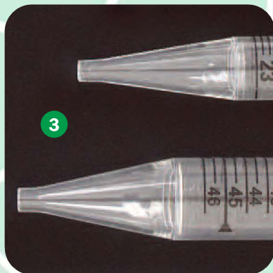
1, 2, 5 & 10mL Serological Pipets

All serological pipets are manufactured to the ASTM Standard Specification for Serological Pipets E-934 1 Bi-directional (positive and negative) graduations are printed in bold easy-to-read black ink 2 10mL Wide Tip Serological Pipet for viscous solutions - Wide Tip opening is 4x larger than standard 10mL pipet 3 25 & 50mL pipets feature an anti-drip tip for accurate delivery 4 Premium material barrier plug 5 Color coded stripes and packaging enable quick volume identification 6 Printed indicator arrow for quickly locating negative graduations when using a pipet controller