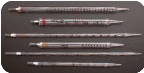
Short vs. standard length pipet comparison